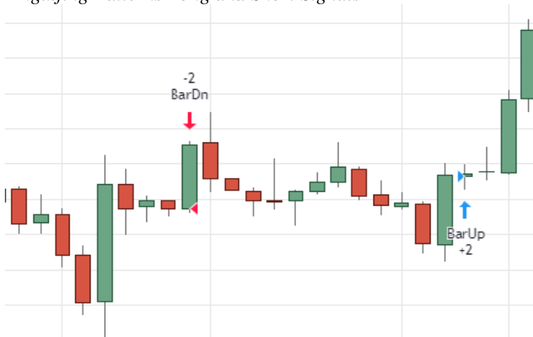
Figure 5. Engulfing Patterns Long and Short Signals

The Engulfing pattern is considered as one of the most powerful trend shift predictors. As can be seen in Figure 5, a bullish Engulfing pattern occur when a large green bar covers entirely a previous day red bar and a bearish Engulfing occurs when a red bar covers entirely a previous day red bar.