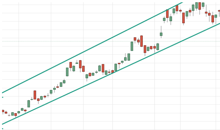
Figure 2. Diagonal Support and Resistance Channel

Figure 1 shows that once the stock price dived down it stopped at a specific low price twice in the examined period. That means that buyers assume that at the support level it is a good price to buy and by doing so they are sending the stock to an uptrend. On the other hand, when the price reaches a specific high price, the sellers become dominant, sending the price back down. This behavior of buyers and sellers is repetitive until a breakout occurs that starts a new up or down trend. This example explains the nature of technical trading in general, it is based on trader's psychology and behavior. Support and resistance lines do not have to be horizontal; they can also be diagonals creating a channel that characterizes the financial asset price movement as can be viewed in Figure 2.