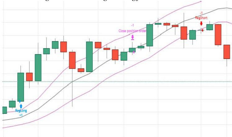
Figure 4. Linear Regression Trading Strategy