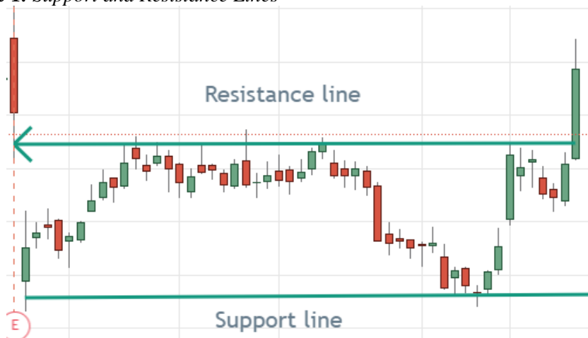
Figure 1. Support and Resistance Lines

An important aspect of technical analysis is Pattern Recognition (PR) which is a well known AI tool in which disturbances are located within an observed phenomenon. In Finance PR is used in two main aspects. First, to locate a trend line breaks of an uptrend or downtrend and candlesticks pattern recognitions that are widely used to locate relatively quick trend shifts. Figure 1 shows the fluctuation of a stock price over a period. Each candlestick represents one trading day.