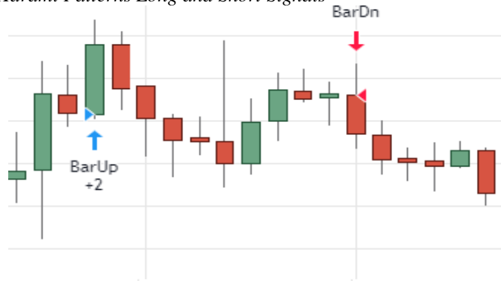
Figure 6. Harami Patterns Long and Short Signals