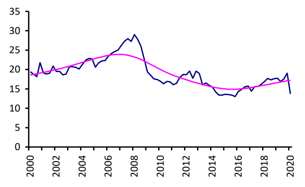
Source: Calculated according to the IMF International Financial Statistics (www.imf.org/data).