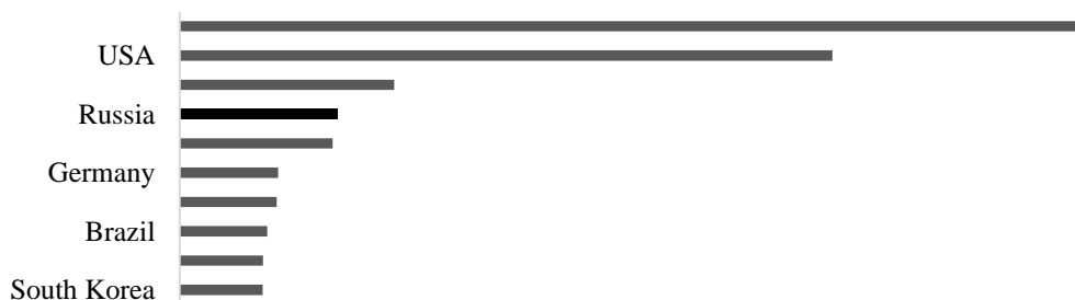
Figure 1. Electricity production by country in 2016, bln kWh.