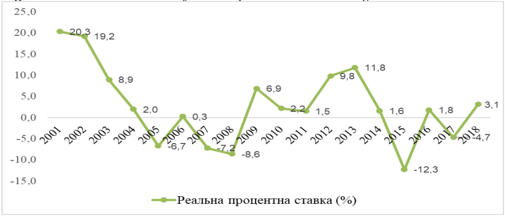
Figure 3. Interrest rates loss of credit operations and lending

One of the negative factors of insufficient level of lending to the real sector is the high level of interest rates (Figure 2), which leads to high cost of credit resources, and macroeconomic problems and risks cause high risks of non-repayment of credit resources by economic agents, as a consequence of securing financial resources in the economy of Ukraine. This is another confirmation of Ukraine's low financial sustainability.