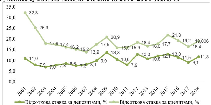
Source: World Bank Financial Sector https://data.worldbank.org/indicator.

One of the negative factors of insufficient level of lending to the real sector is the high level of interest rates (Figure 2), which leads to high cost of credit resources, and macroeconomic problems and risks cause high risks of non-repayment of credit resources by economic agents, as a consequence of securing financial resources in the economy of Ukraine. This is another confirmation of Ukraine's low financial sustainability.