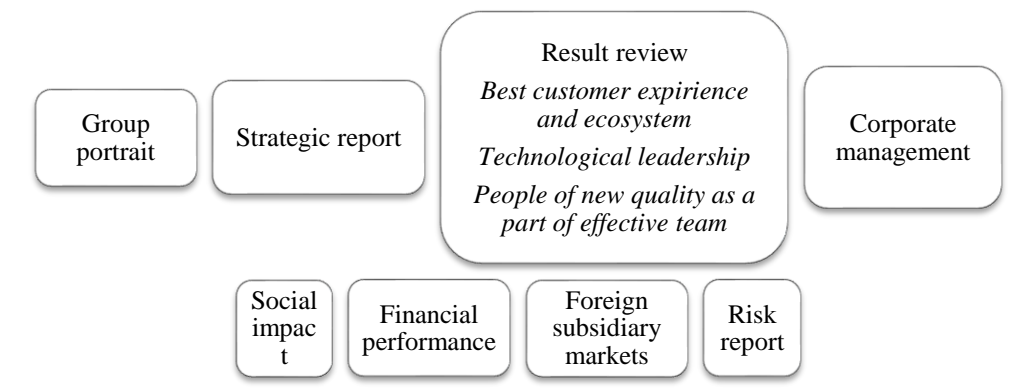
Figure 3. Structure of the Sberbank PJSC annual report for 2017, 2018 (Sberbank PJSC Annual report, 2017; 2018).

In the annual report for 2018 (see Figure 3) Sberbank PJSC emphasizes the importance of the Sustainable Development Goals adopted in 2015 by the General Assembly of the UN and notes that in its activities it is focused on 7 goals, including "promoting progressive, comprehensive and sustainable economic growth, full and productive employment and decent work, revitalization of the global partnership for sustainable development and build resilient infrastructure, promote sustainable industrialization and foster innovation" (Sberbank PJSC annual report, 2017). In the next annual report for 2018, the bank is already focusing on 10 of the sustainable development goals, including "promoting progressive, inclusive and sustainable economic growth, full and productive employment and decent work, revitalization of the global partnership for sustainable development and build resilient infrastructure" (Sberbank PJSC annual report, 2018). The report of the second largest bank in Russia, which is VTB Bank PJSC has a structure like the previously considered report structure of Sberbank PJSC.