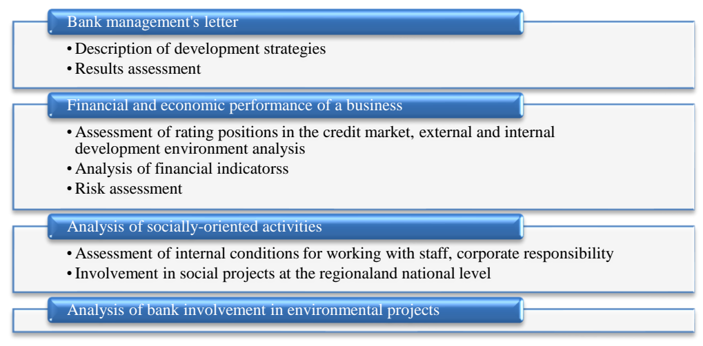
Figure 4. The standardized model of the sustainable development report (compiled by authors).

Speaking about Russian realities, it is important to note that each Russian bank has its own vision of a sustainable development reporting model. At the present stage, there are no uniform principles for building statements, which gives reason to argue about the need to implement a single model (Figure 4).