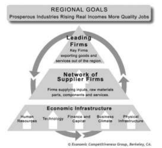
Figure 1. Cluster-driven development process

Different regions experienced dynamism and robustness when different clusters have dialogue and positive relationship not only among themselves, but also with government or the clusters' support institution (i.e universities). These are the regions that saw faster growing economies, higher job, and wage and wealth creation than regions where clusters are not well integrated.