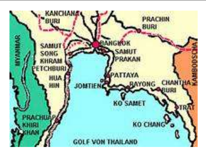
Figure 1. The East coast provinces of Thailand

The potential tourism markets, and massage health spa in Thailand is constantly evolving. A rapid growth is anticipated in the business district and tourist attractions. Tourism is one of a group of businesses/industries that has high growth potential. To extract revenue from foreign visitors--more than 24,000 million in 2012, the Russian tourists are calculated to travel to Thailand, with not less than one million people travelling to the cities. The city of Pattaya is a potential tourist town in the eastern province are Active Beach